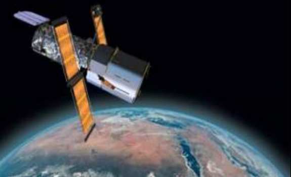
F. HUBBLE TELESCOPE