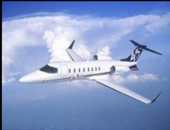
E. JET AIRPLANE