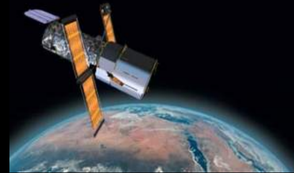
F. HUBBLE TELESCOPE