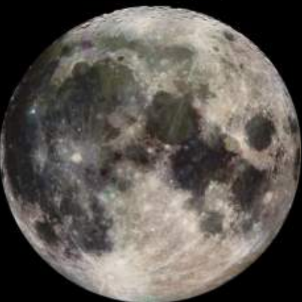
D. THE MOON