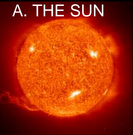
A. THE SUN