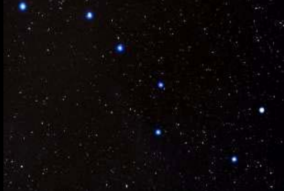
H. STARS OF THE BIG DIPPER