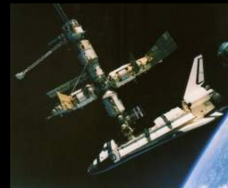
C. SPACE SHUTTLE