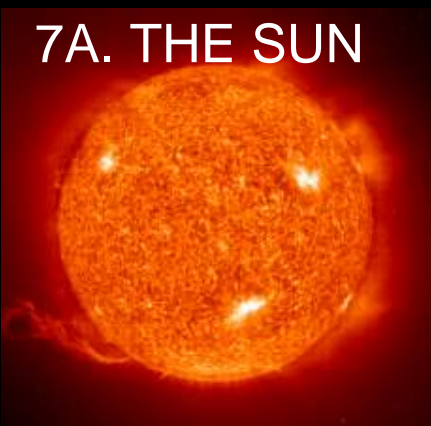
7A. THE SUN