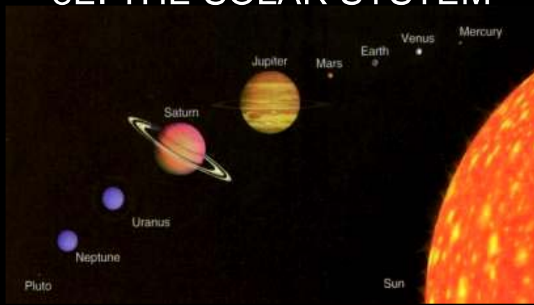
8E. THE SOLAR SYSTEM