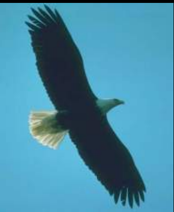
G. AN EAGLE