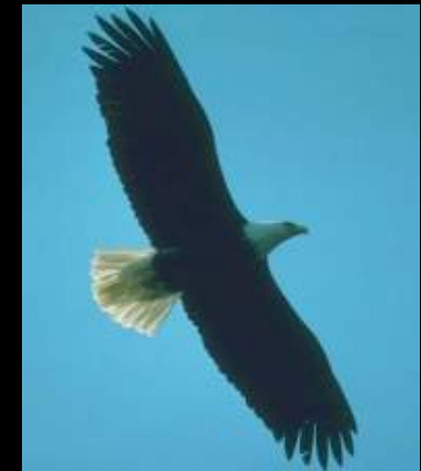
G. AN EAGLE