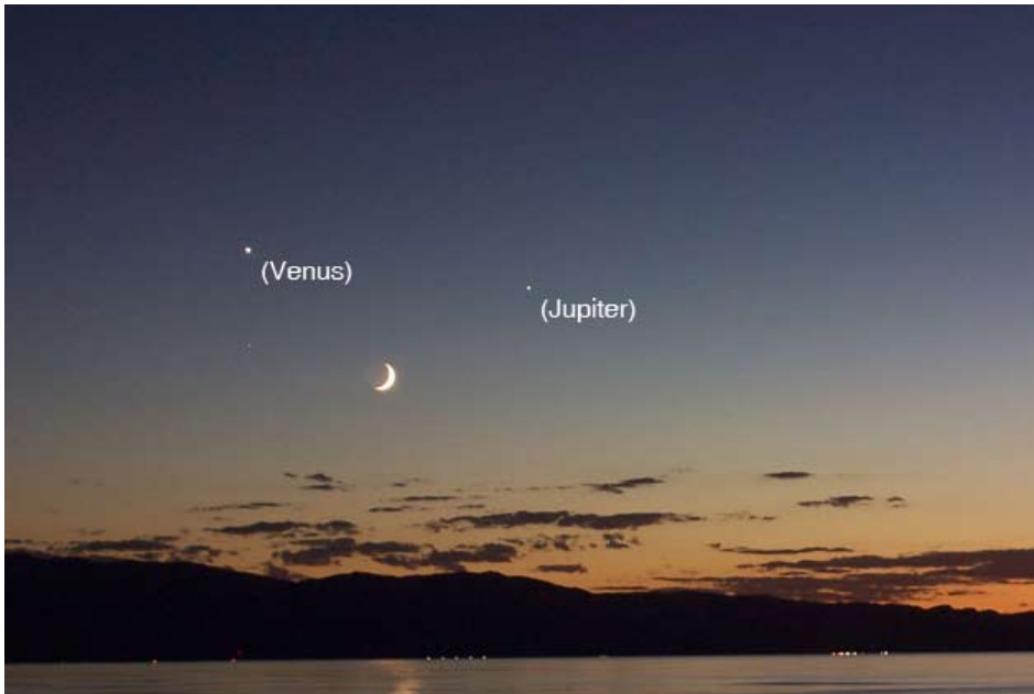
Taken in Salt Lake City in 2005, the above photo is a similar representation of how Venus will be viewable in the night sky this fall. The planet will appear in the gibbous state for the remainder of 2008.

Venus will appear in a gibbous phase for the rest of 2008. By next spring, it will appear as a crescent.